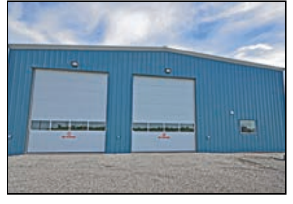
Left: Exterior of new maintenance building Right: Interior of new