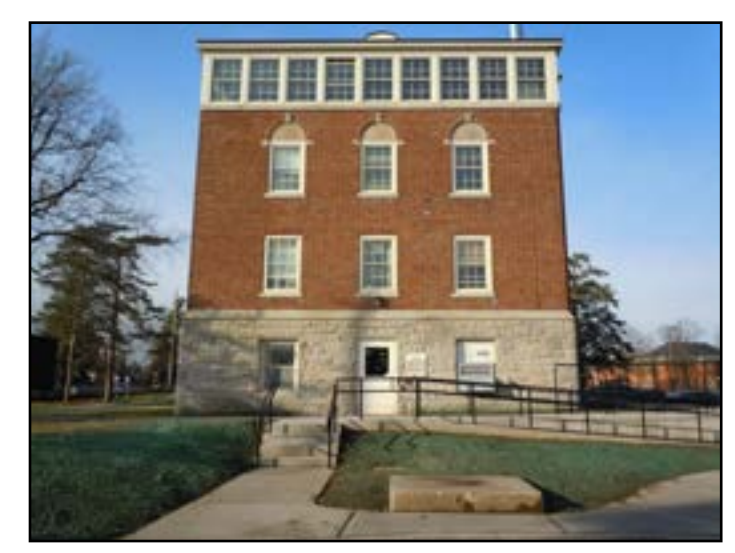
South side pathway and staircase.

The interior modifications included replacing door hardware, relocating light switches and adding elevator signage to help the building meet new accessibility codes.