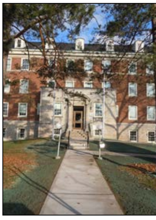
West side pathway.