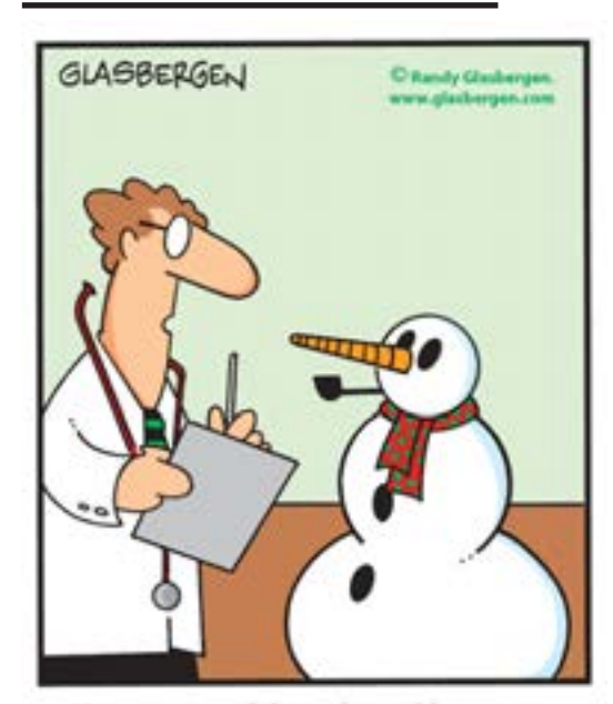
"Lose some weight, quit smoking, move around more and eat the carrot."